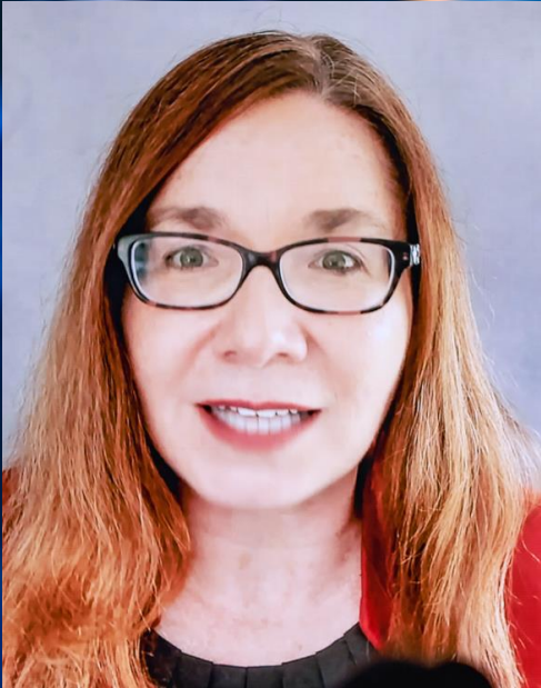
Katharine Hayhoe Chief Scientist, The Nature Conservancy